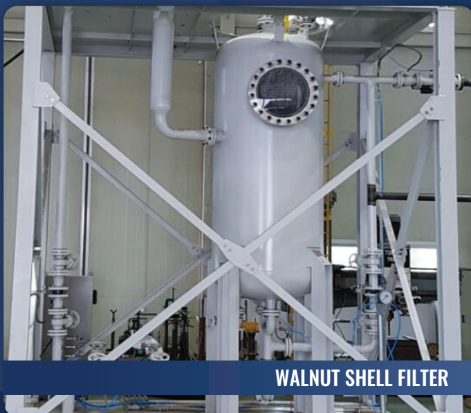
WALNUT SHELL FILTER

The Walnut Shell Filter effectively removes free oil and suspended solids from produced water, refinery wastewater and any water source. It is highly efficient in treating suspended solids, oily residues, ash and metallic hydroxides from industrial liquids generated by petrochemical and other industries. Walnut shell media are resistant to heavy oil surges and experience significantly less fouling compared to other media.