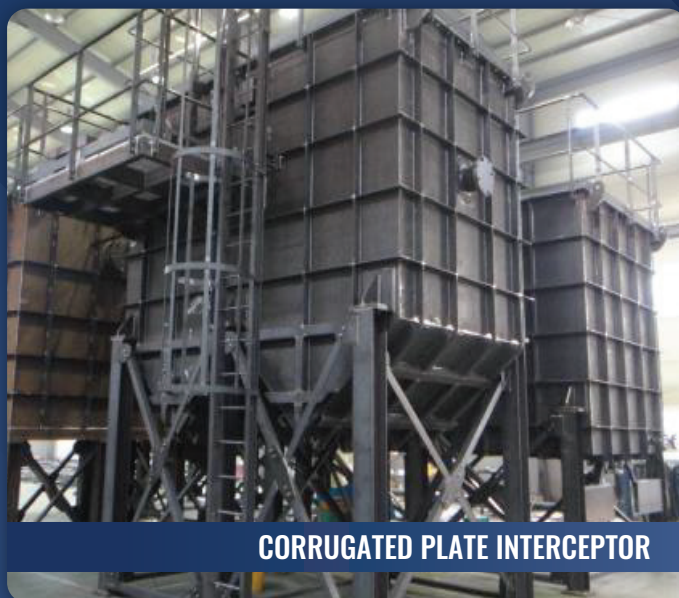
CORRUGATED PLATE INTERCEPTOR